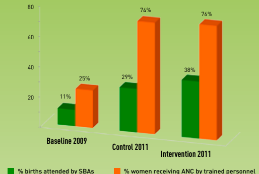
Household Survey comparison, 2009-2011: Jigawa state